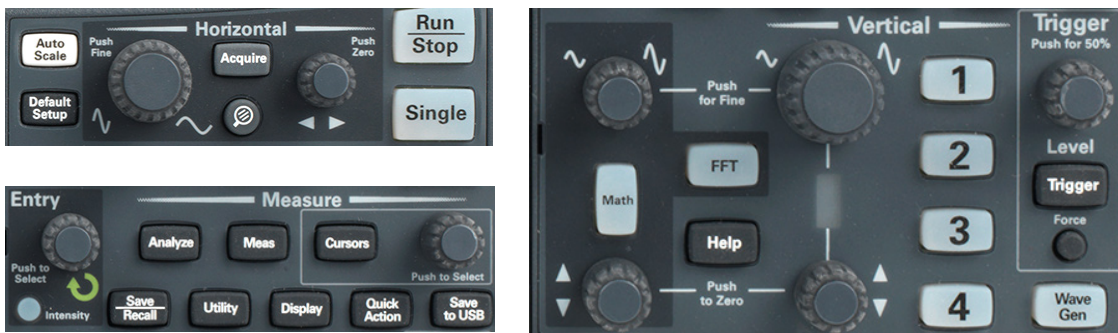
Figure 2. Oscilloscope front panels should include knobs for all key setup variables.