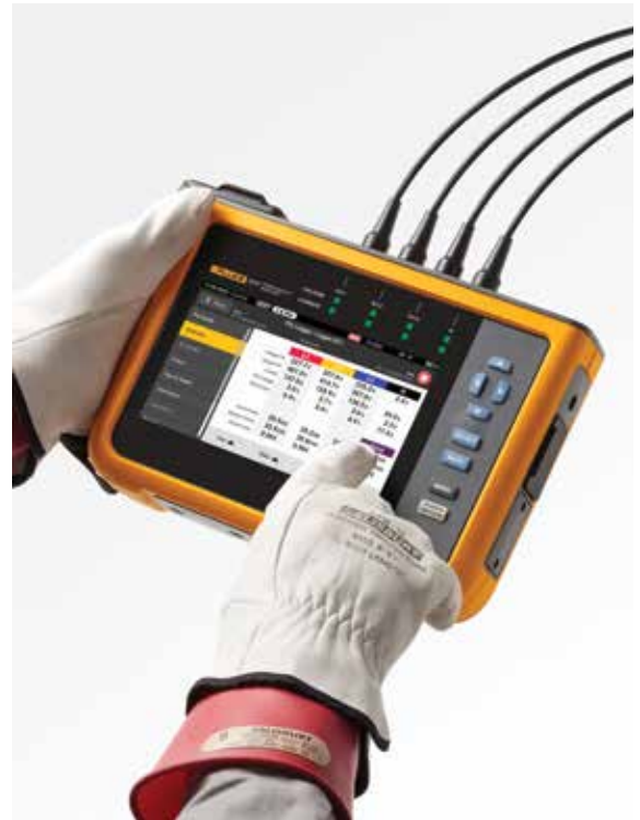
Easily navigate using the large color touchscreen

When downloading data from the Fluke 1770 Series Power Quality Analyzers the included Energy Analyze Plus software package can compare measured voltage and current harmonic statistical data to different standards, like EN 50160 or IEEE 519, to determine if they exceed compliance limits. This powerful predictive maintenance feature enables current harmonics to be observed before distortion appears in the voltage allowing you to prevent unexpected failures or non-compliance situations and increase system uptime. With the proliferation of inverter-based loads and power generation, keeping current harmonics in check is becoming increasingly critical to ensure reliable power quality and avoid system downtime.