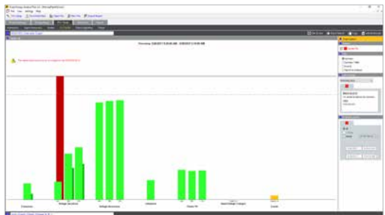
Fluke Energy Analyze Plus: Power quality health summary