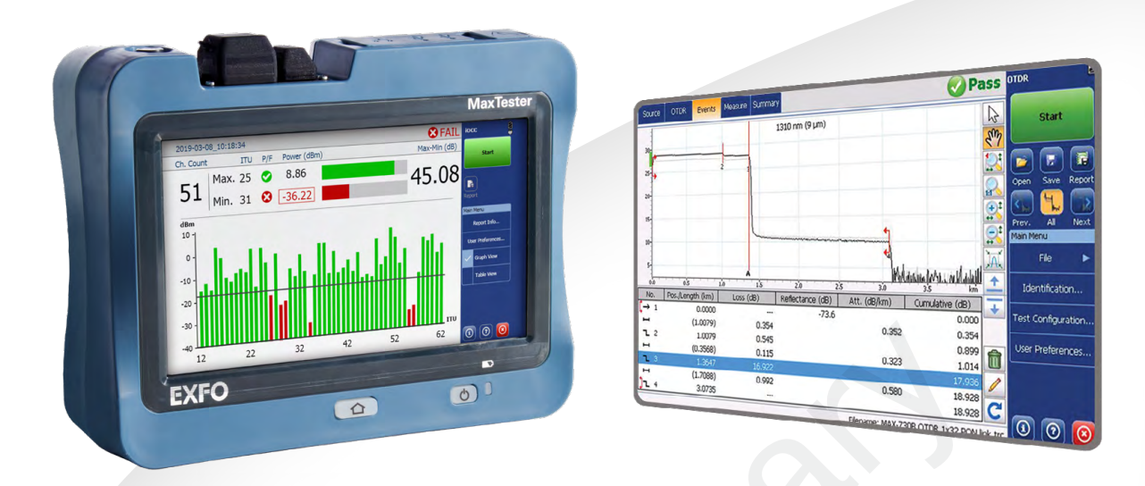
Feature(s) of this product is/are protected by one or more of : US patent 8,576,389 and equivalent patents pending and/or granted in other countries; US patent 9,170,173; US patent 9,571,186; US patent 10,014,935; US patent 9,641,243; US patent 9,134,197 and equivalent patents pending and/or granted in other countries; and US 9,506,838, US design patent D710,222 and equivalent(s) in other countries; and other US pending patent(s).