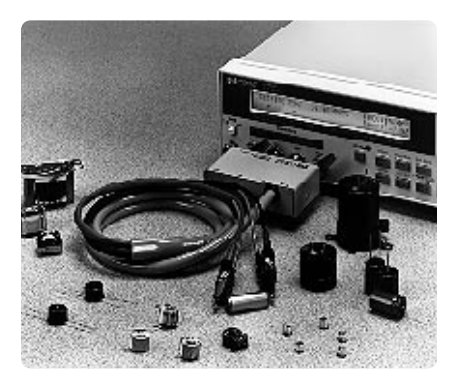
Make reliable impedance measurements.