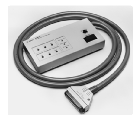
16064B LED display/trigger boxDisplays comparator status.1.5 meter cable. External trigger.