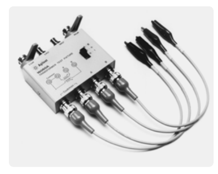
16060A transformer test fixture Allows fast connections to transformers