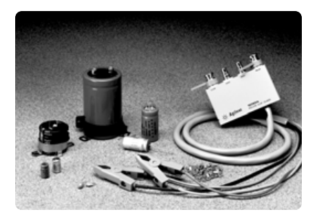
Quickly evaluate electrolytic capacitors.