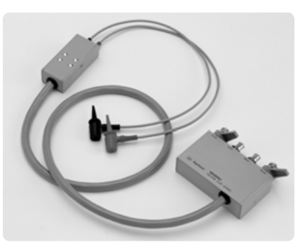
16089C Kelvin IC clip leads IC package clip. 1 meter length.

16065C external bias adapter For external dc bias of DUT. Vmax \leq 40 Vdc.