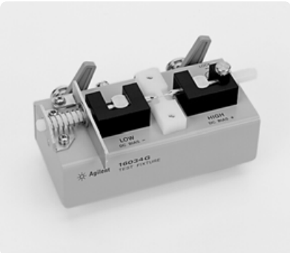
16034G Test fixture For SMD components.

16089D Alligator clip leads Four clips. 1 meter length.